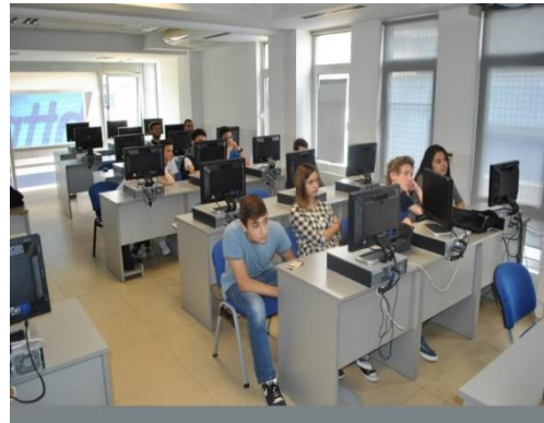
Figure 7: Info Days for students, Faculty of Information Technology, University “Mediterranean”