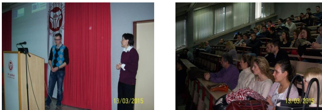
Figure 1: Student information day - Baektel Workshop Meeting, University of Tuzla

On the 13 th of April 2015, University of Tuzla was a host of the Info day for students. The presentation was followed by discussion in which the students had many questions both in terms of their involvement in the implementation of OER content and in terms of OER content. It covered many fields associated with the Tempus project – BAEKTEL. These include: Implementations of OER Procedures and Manuals, BAEKTEL Portal Development, training of the personnel responsible for the construction of the OER content, future upgrades of the OER content, creating and maintaining an interactive web site, preparation of educational and professional materials for OER depositories. The discussion also involved a strategy development for the BAEKTEL network sustainability.