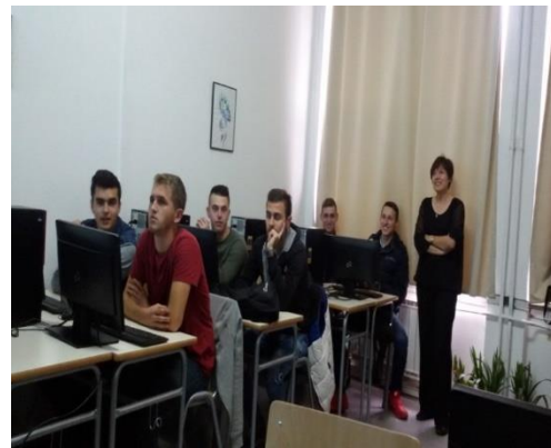
Figure 6: Student Information Day, University of Tuzla, Faculty of mining, geology and civil engineering