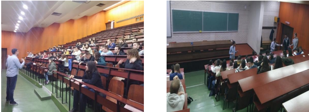
Figure 8: Student information day, University of Niš, Faculty of Electronic Engineering