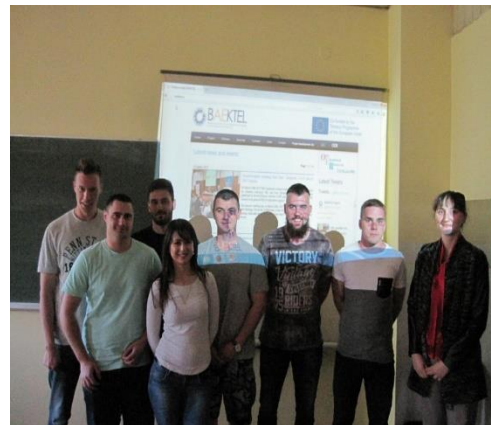
Figure 9: Student Information day, Faculty of Technical Sciences, Čačak