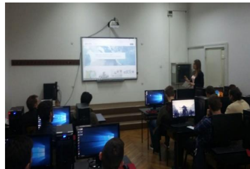
Figure 11: Second student Information day, Faculty of Mining and Geology, University of Belgrade

This project has been funded with support from the European Commission. This publication reflects the views only of the author, and the Commission cannot be held responsible for any use which may be made of the information contained therein.