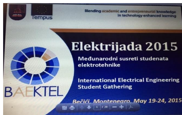
Figure 2: International Electrical Engineering Student Gathering, Bečići, Montenegro

Elekrijada 2015 International Electrical Engineering Student Gathering was organized from 19 th to 24 th of May 2015. Participants were students of electrical engineering, computer science and electrical engineering automation from Montenegro and abroad. Participants were presented BAEKTEL project, its main goals and objectives as well as importance of OER for future.