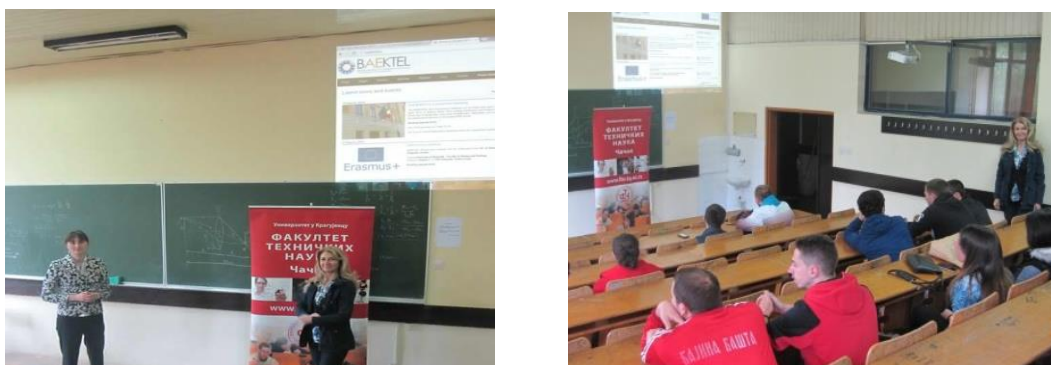
Figure 3: Student information day, University of Kragujevac

On the 20 th of April 2016, the Info Day for students at the Faculty of Technical Sciences Čačak, University of Kragujevac was organized. It was attended by students of Information Technology and Technics and Informatics. Students were able to learn about the development of open educational resources (OER), as well as the purpose and activities of the BAEKTEL project.