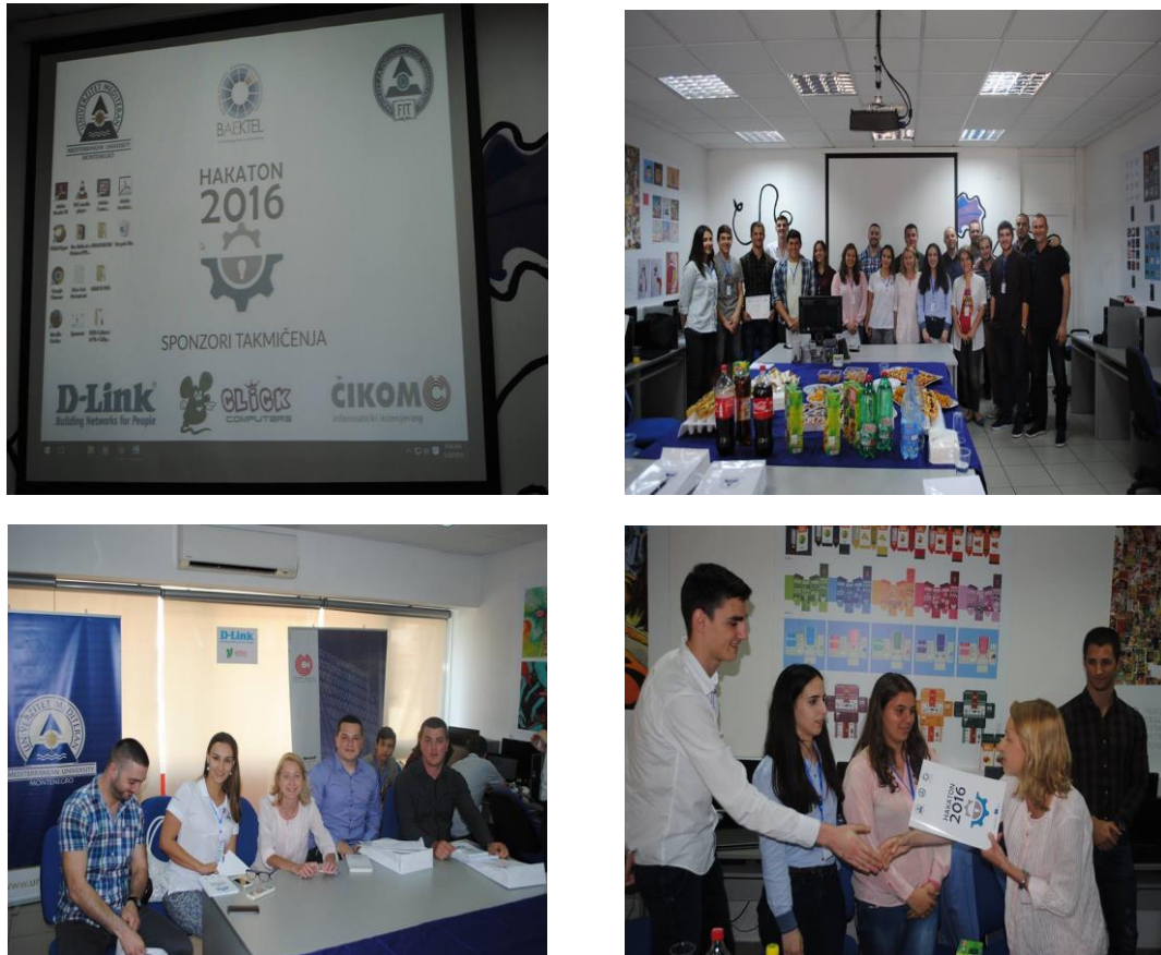
Figure 5: HAKATON competition at the Faculty of Information Technology, University “Mediterranean”

teachers and IT specialist from business industry. The central theme of the competition were open educational resources (OER).