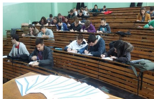
Figure 10: Student Information day, Faculty of Mining and Geology, University of Belgrade