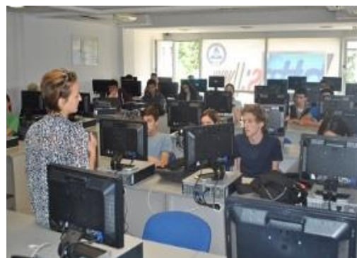
Figure 4: Student information day, University “Mediterranean”

On the 26 th of May the workshop for students of three universities and high school scholars was organized on Faculty of Information technologies University Mediterranean. The workshop was the introduction for competition HAKATON which is organized on UNIM for several years. The main topics of the workshop was BAEKTE Platform as a model for Integration OERs in Theoretical and Vocational Knowledge at universities and secondary schools in Montenegro.